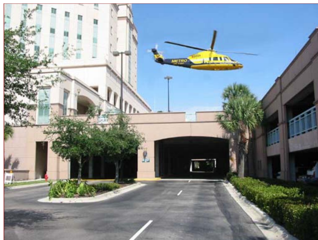
Rendered picture of West Palm Beach VAMC Heli-Stop at completion.

QproQ Engineering, Inc. has been mentioned in the "Times Leader" repeatedly this year. Beginning with an interview in January titled "Engineering Expansion". This interview focused primarily on a project for the West Palm Beach Veterans Affairs Medical Center . QproQ Engineering, Inc. was selected as Prime Design Consultant for the VAMC's heli-stop design. This project entailed design for an elevated heli-stop located at the existing emergency entrance of the hospital in West Palm Beach, FL. Since January; articles regarding other QproQ projects like; Mission Foods Production Facility and Graham Packaging Company Bottle Conveyor Bridge, have been seen in the Times Leader. As we roll into our fall season, 2005 continues to bring forth challenging and rewarding projects to QproQ. We here at QproQ Engineering, Inc. look forward to our future civil/structural engineering endeavors.